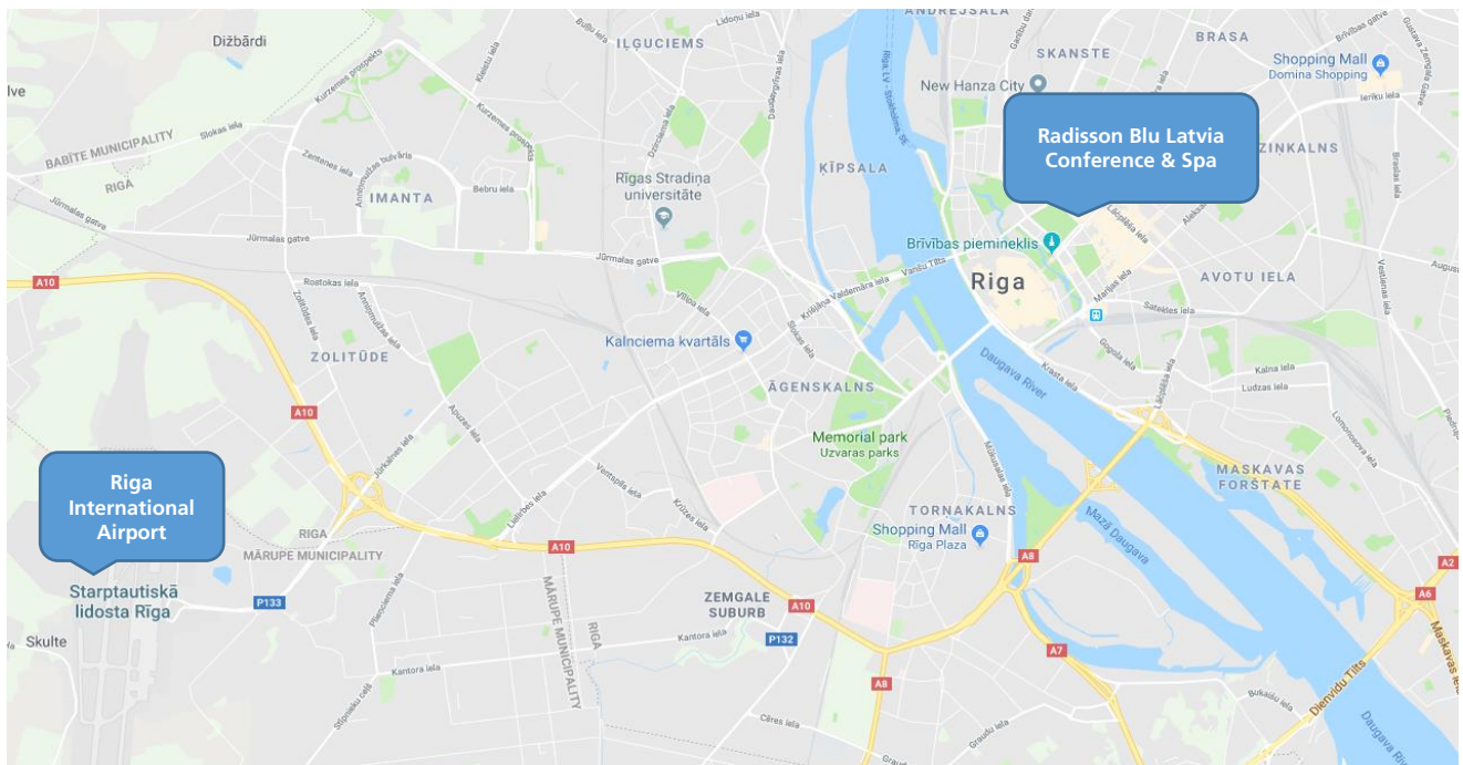
The map of the Host City – Riga indicating the accommodation venue and the airport

Distance of venue to the Riga international Airport – 10 km, length of journey – 15-20 min.